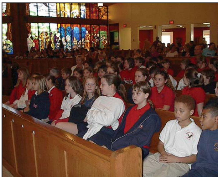
The matinee concerts are an educational event mixed with performances