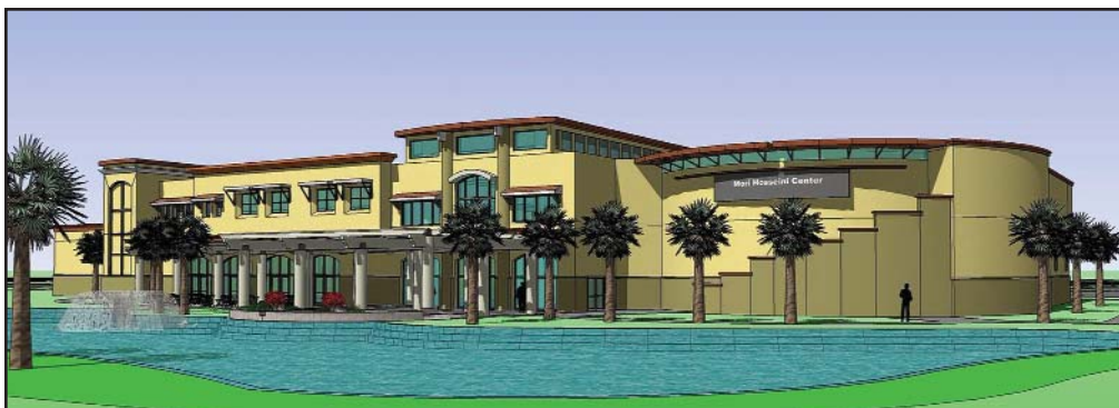
Southeast Museum of Photography's Hosseini Center