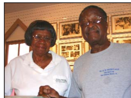
(See Couple Page 3)

The pair's hard work and dedication was validated recently when the Black Heritage Museum was honored with the City of New Smyrna Beach's 2006 Historic Preservation Award.